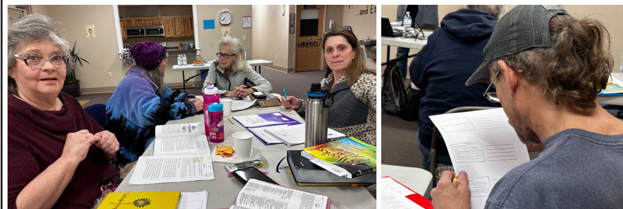
Depression & Anxiety Relief seminar