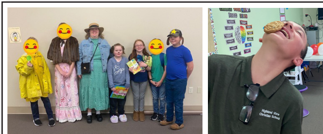
HVCS Activities (Spirit Week, PE games, Butte Symphony field trip)