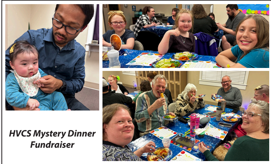
HVCS Mystery Dinner Fundraiser