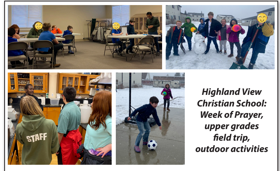
Highland View Christian School: Week of Prayer, upper grades field trip, outdoor activities